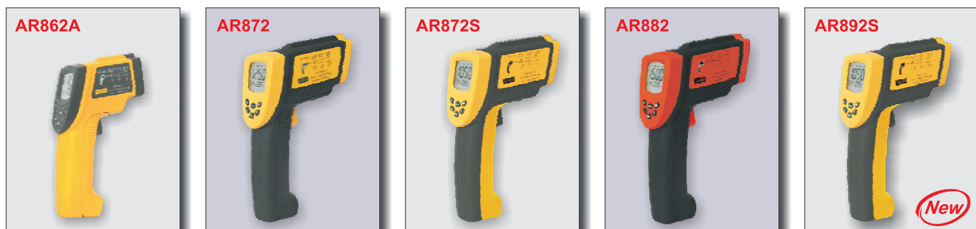
Ratio of distance & spot D:S — the distance (D) from the object to be measured and the spot size (S) of the object

Infrared thermometer measures the surface temperature of an object. The unit's infrared sensor sense radiation energy which is collect and focused onto a detector. The unit translate the information into a temperature reading which is displayed on the unit. For increased ease and accuracy the laser pointer makes aiming even more precise.