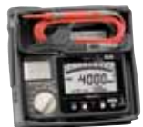
Example of storage configuration