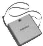
Carrying Case C0100