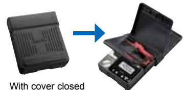
With cover closed